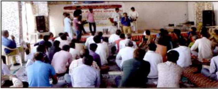
Farmers training at Jamvali Villege on Panchgavy by KVK, Jamnagar (February 24-26, 2018)