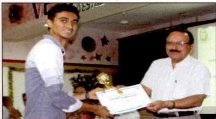
Felicitation of winners of slogan competition