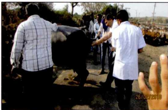
Gynaecological examination during Camp

A special Veterinary Clinical Camp was organized by Bhanvad Mahajan Panjarapol Gaushala, Bhanvad in collaboration with COVS&AH, JAU, Junagadh and Animal Husbandry Department, Jamnagar district on February 4, 2018 at Bhanvad, which was sponsored by Saurashtra Prani Kalyan Trust . During the camp, one hundred sixty (160) animals were treated for different medical, surgical and gynaecological ailments. Additionally, nine thousand one hundred fifty (9150) animals were de-wormed with anthelmintic and two hundred fifty (250) animals were vaccinated for FMD. A total ninety six (96) livestock owners were direct beneficiaries of the camp. Similar Veterinary Clinical Camp was organized by Polytechnic in Agriculture, Dhari as part of NSS activity in collaboration with College of Vet. Science & Animal Husbandry & AH, JAU, Junagadh on February 26, 2018 at Sukhpur (Dhari). During the camp, Fifty-one (51) animals were treated for different medical, surgical and gynaecological ailments. A total thirty-six (36) livestock owners were direct beneficiaries of the camp.