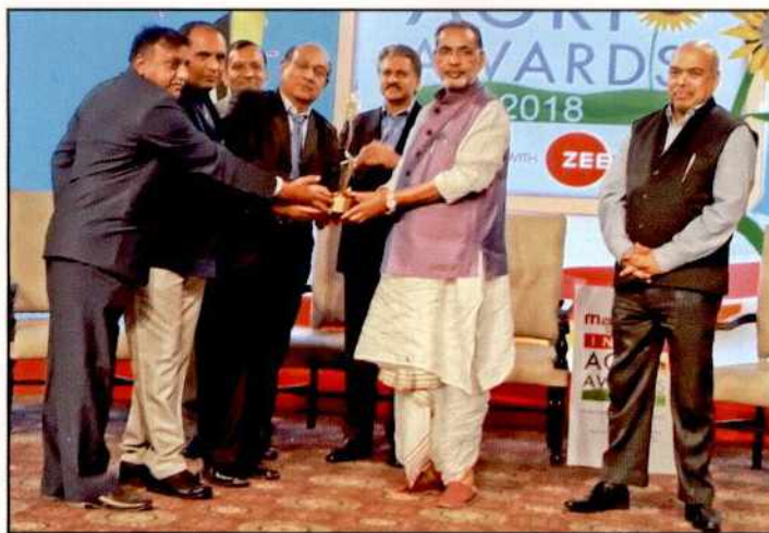
MAHINDRA SAMRIDDHI" Award to JAU