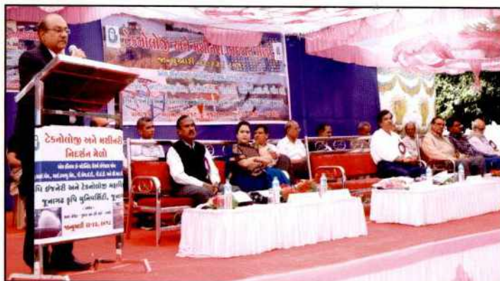
Inauguration Function of "Technology & Machinery Demonstration Mela"