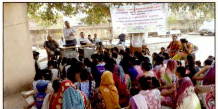
Bakery training to women of Sukhpur village (February 27, 2018)