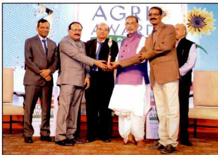
National Best KVK of the year - Runner-up Mahindra Samriddhi Agri India Award - 2018