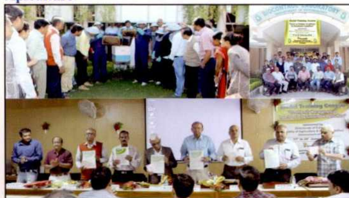
Training in Apiculture