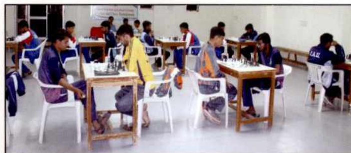
Gujarat State Inter Agricultural University Chess Tournament