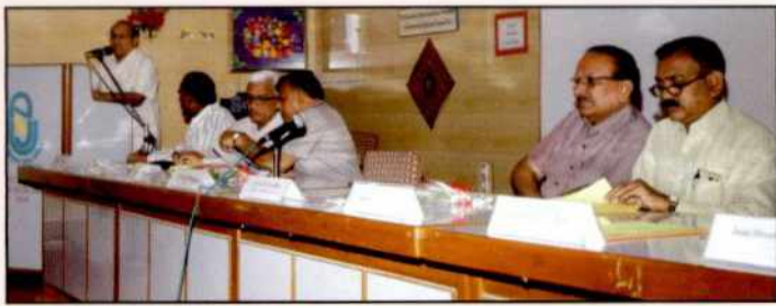
Felicitation of winners of slogan competition

Bio-control Research Laboratory, Department of Entomology, JAU, Junagadh organized two model training courses, of which first “Eco-friendly Management of Insect Pests for Sustainable Agriculture” was organized during January 17-24, 2018 and second, “Hands on Training of Apiculture for Sustainable Agriculture” was during February 5-12, 2018. Total of 24 and 28 participants from SAUs of Gujarat participated in first and second model training programme, respectively.