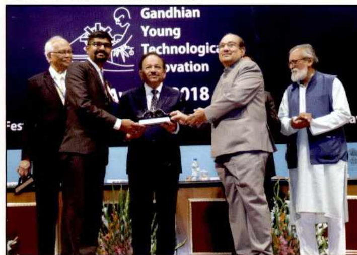
Gandhian Young Technological Innovation (GYTI) Award