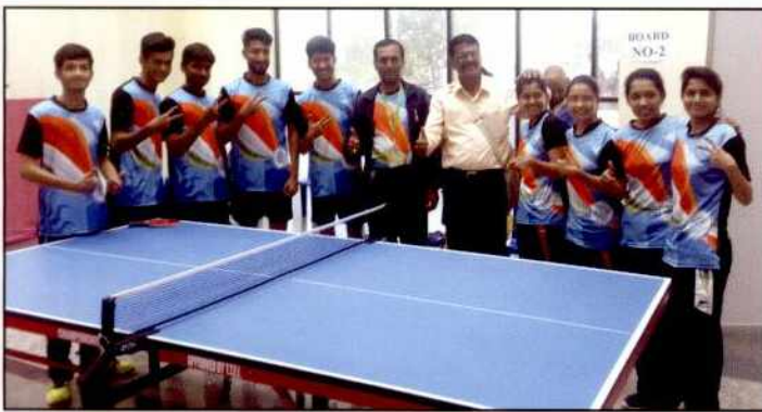
Gold Medalist Table Tennis Teams of Boys and Girls