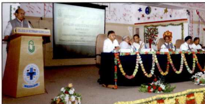
Inaugural Ceremony of Orientation Workshop of Institutional Development plan of JAU