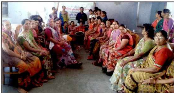
Farm women training programme at KVK, Targhadia (March 08, 2018)