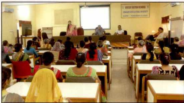
Celebration of International Women Day at KVK, Porbandar (Khapat) (March 08, 2018)