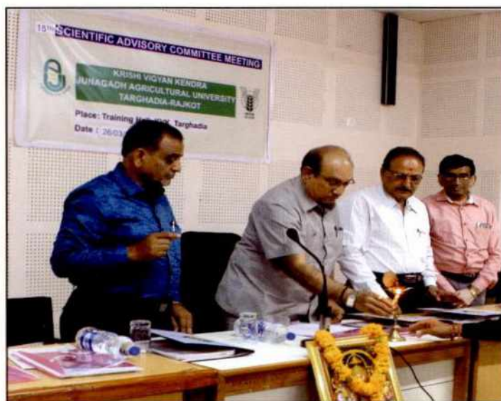
SAC Meeting at KVK, Targhadia