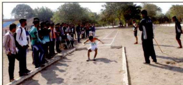
Long Jump Event Inter College and Inter Polytechnic Athletics Meet 2018