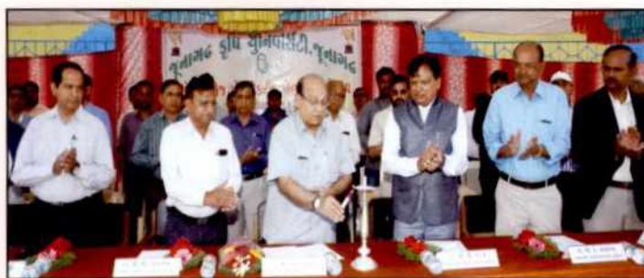
Inauguration of Inter College and Inter Polytechnic Athletics Meet 2018