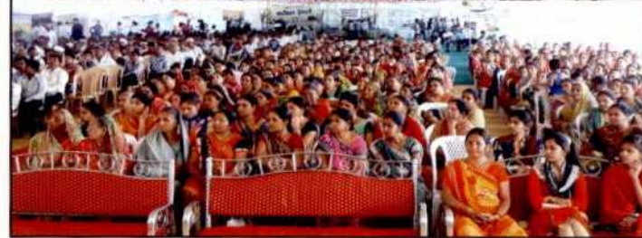
Scientists of KVK, Surendranagar guided 1859 farmers and farm women on scientific agriculture during Krushi Mela held at Vadhvan (March 27, 2018)