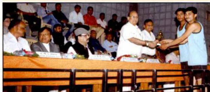
Medal award ceremony of Inter College and Inter Polytechnic Athletics Meet 2018