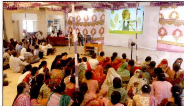
A live webcast of Krishi Unnati Mela programme of Hon. Prime Minister on the theme of "Doubling Farmers Income By 2022" held at IARI New Delhi was organized at KVK Pipalia (March 17, 2018)