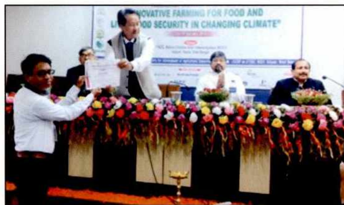
Best Oral Presentation Award