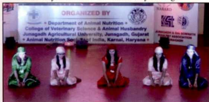
Celebration of “Vet Lion-2018”