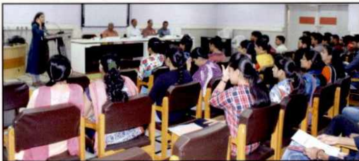
Training programmes on "Empowering Youth Through Life Skills"