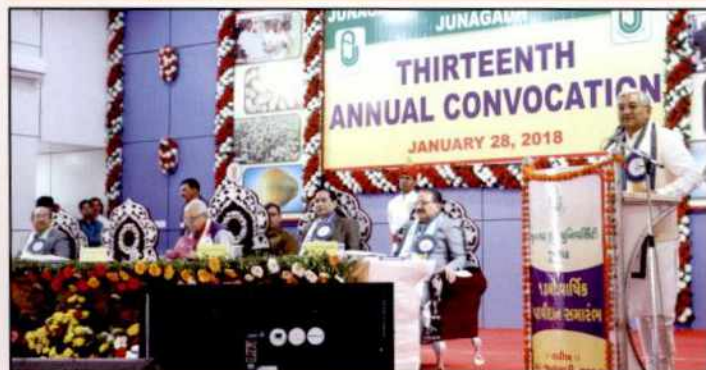
Shri R. C. Faldu, Hon'ble Minister of Agriculture, Rural Development, Fisheries, Animal Husbandry and Transport, Govt. of Gujarat addressed the august gathering during convocation