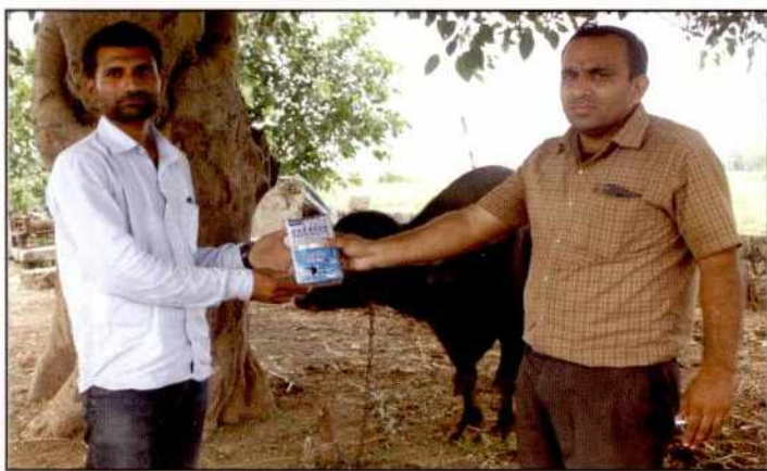
FLD on Bypass Fat at Villages of KVK, Porbandar (Khapat)