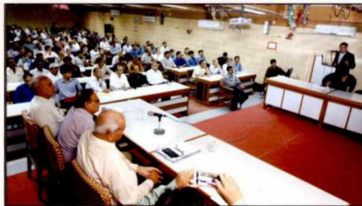
Government e-Marketplace (GeM) Awareness Training organized by the Information Technology Cell, JAU, Junagadh. (February 23, 2018) at Seminar Hall, CAET, JAU, Junagadh