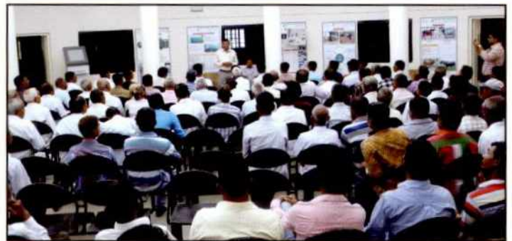
Visit and training of farmers at Educational Museum