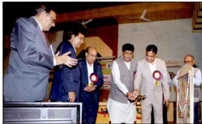
Inauguration Ceremony of 33 rd Annual Workshop of AICRP on Post Harvest Engineering and Technology

attended the workshop and presented their research reports and discussed the formulation of new technical programmes.