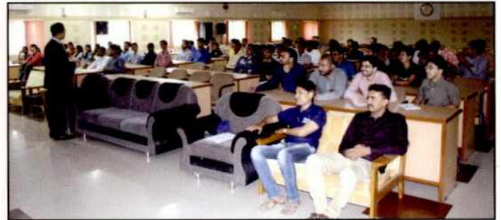
Training Programme on "Campus to Corporate"

University for the 201 Students of different faculties during March, 16-18, 2018. The first one was at College of Fisheries, Veraval on March 16, 2018 (58 Students), followed by College of Agriculture, Junagadh on March 17, 2018 and Motabhandariya (Amreli) (72 Students) and College of Veterinary Science & Animal Husbandry (71 Students) on March 18, 2018.