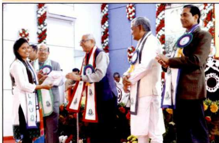
Shri O. P. Kohli, Hon'ble Governor of Gujarat and Hon'ble Chancellor of JAU, Junagadh conferred the medals to the meritorious students during the Annual Convocation