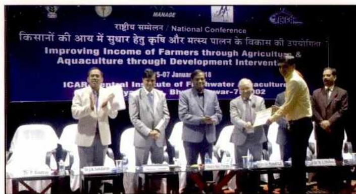
"Best Poster Presentation award"