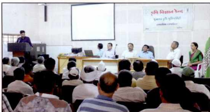
Krishi Vigyan Kendra, JAU, Targhdiya, organized live Krishi Unnati Mela 2018 webcasting programme of Hon'ble Prime Minister's speech on March 17, 2018