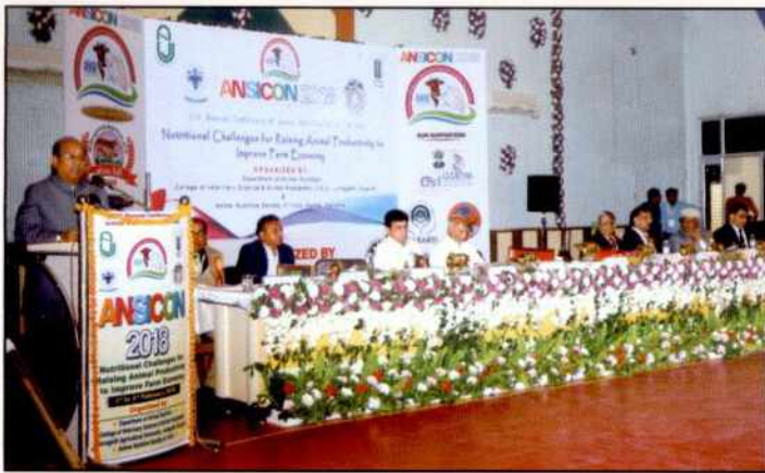
Inauguration of ANSICON-2018