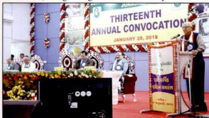
Shri O. P. Kohli, Hon'ble Governor of Gujarat and Hon'ble Chancellor of JAU, Junagadh addressed the Annual Convocation