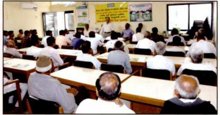
Farmers' Training at T&V program organized by IFFCO & JAU (January 18, 2018)

were benefited. One booklet "Gujarat Rajyana Agatyana Pakoni Sendriya Kheti" was published by Sardar Smruti Kendra , Directorate of Extension Education, JAU, Junagadh during March, 2018.