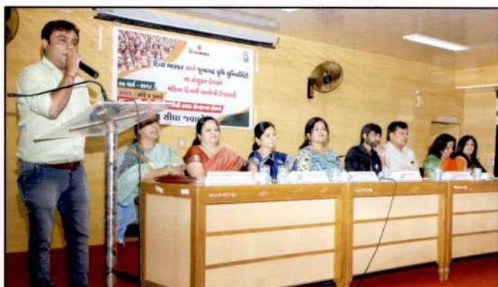
A celebration of "International Women Day"