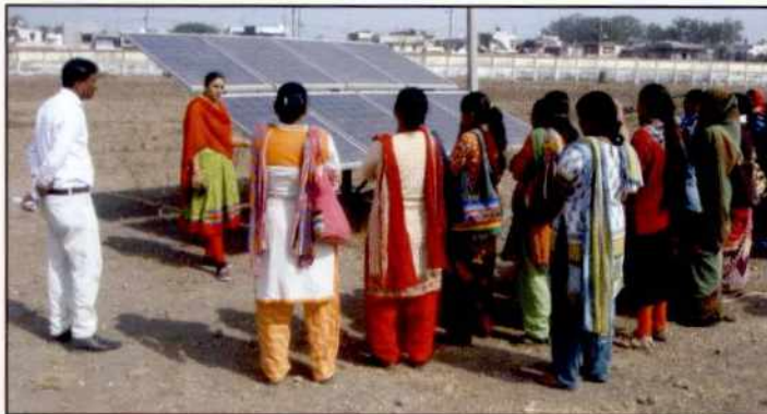
Farmers' visit to KVK, Jamnagar (February 01, 2018)